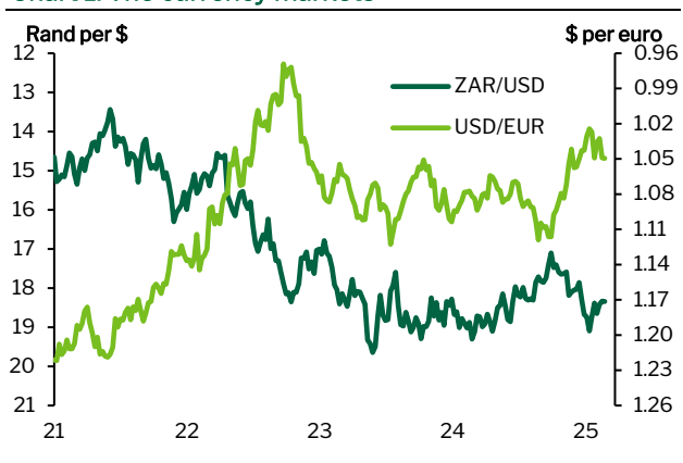
Chart 1: The currency markets